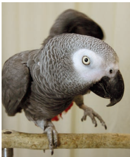
Alex, an African gray parrot who died in 2007, was the subject of 30 years of scientific study. He learned more than 100 words before his death and could distinguish colors and numbers.

While birds and mammals share many neurological features, assessing conscious states in invertebrates, such as cuttlefish and octopuses, is more difficult. Unlike in mammals, where a large central brain is connected to a relatively