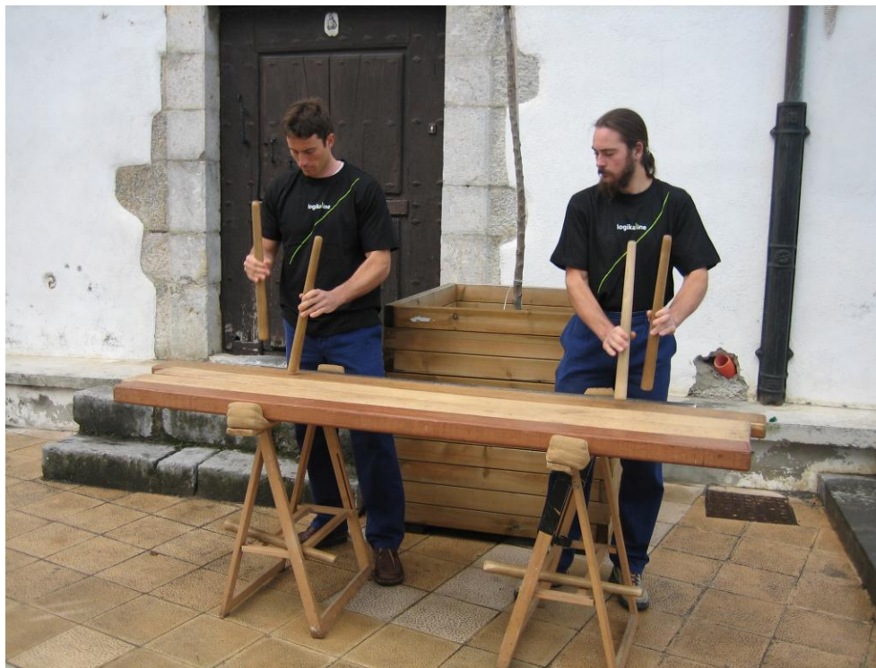
Figure 1. The Ugarte brothers playing txalaparta.