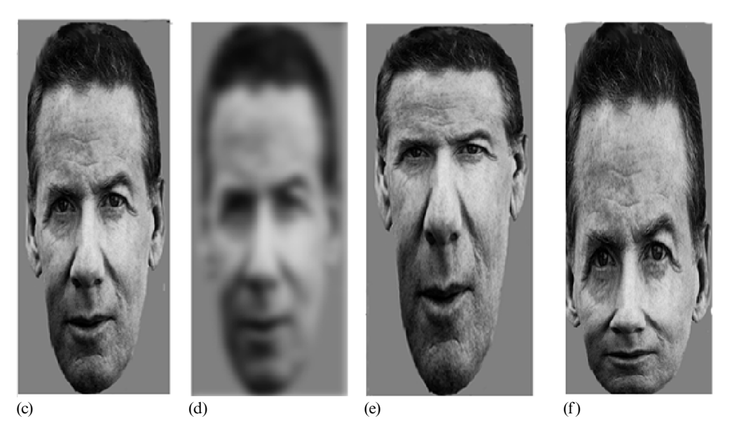
Figure 2. Examples of the manipulations used in experiments 3 and 4: (a) normal, (b) blurred normal, (c) vertical stretch, (d) blurred vertical stretch, (e) bottom stretch, (f) top stretch. Manipulations (a), (c), (e), and (f) were used in experiment 3; manipulations (a) to (d) were used in experiment 4. For reproduction purposes, these are shown at relative sizes which are different to those used during the experiments (for full details, see text).