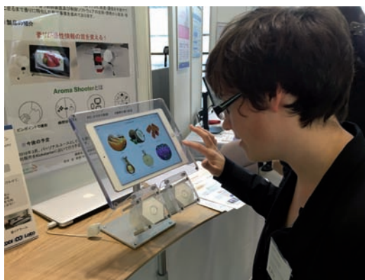
Figure 3. AromaShooter—an example for a smell-delivery device with six scent cartridges that's connected through USB (developed by Aromajoin). Here, a user is viewing a demo and can select different scents on a tablet connected to the AromaShooter.

standing of the sensory system (such as in psychology, neuroscience, and sensory science) will we be able to open up new design opportunities for future smell-based interactive technologies. Those knowledge-based advancements are relevant in a variety of contexts, from entertainment to rehabilitation to immersive experiences in virtual reality.