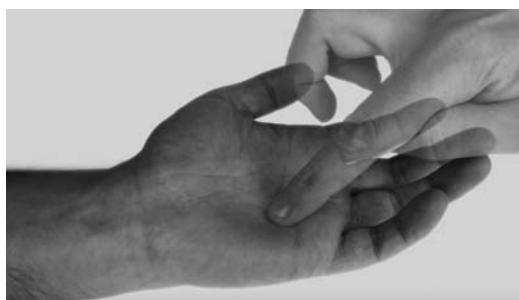
Figure 2. Exploring the communication of emotions through a haptic system that uses tactile stimulation in mid-air. 6 The study focused on specific design implications based on the spatial, directional, and haptic parameters of the created haptic descriptions and illustrated the design potential for HCI. (See the video at https://youtu.be/OBOxuFmsxBY .)

For example, some of the innovative devices present in the market do not account for the complexity related to humans' olfactory perception (habituation, threshold perception, and so on) or for the interaction that smells can have with other sensory information (designing experiences with multisensorial integration, for example). Only by combining knowledge in HCI with other disciplines, and their under-