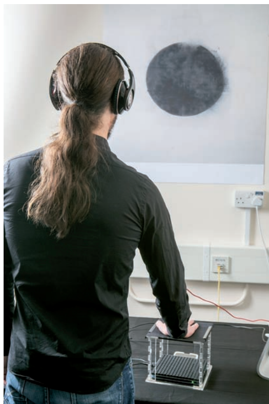
Figure 1. The tactile experience using mid-air haptic technology was iteratively designed and tested in the SCHI Lab before it was integrated into the Tate Sensorium—a six-week multisensory art exhibition at the Tate Britain art gallery in London. Each user was presented with tactile sensations on the hand while looking at a painting (a poster printout for the lab testing) and listening to synchronized sound.

feedback (touch), scents (olfaction), and a complex chocolate taste (gustation). This was a collaborative project led by Flying Object ( www.wereflyingobject.com ), a creative studio based in London. The SCHI Lab team provided advice on multisensory experience design and was mainly responsible for the design of the tactile experience using mid-air haptic technology (a novel touchless interaction modality 5,6 ) and the accompanying user study (see Figure 1).