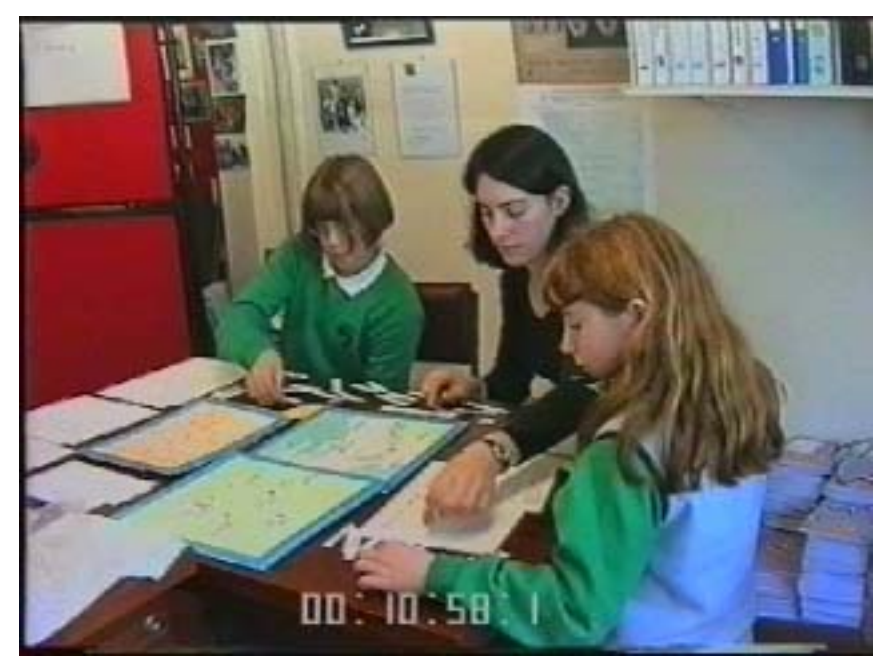
Figure 2 - Video still from Wizard of Oz experiment