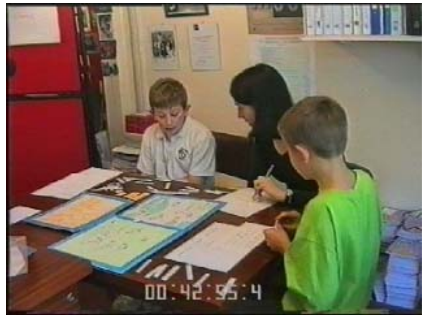
Figure 3 - Video still from Wizard of Oz experiment

The 'computer' (child) had 2 pictures of all of the organisms that they placed on the world view and the web view when the 'user' added them to the environment. The 'computer' (child) had a pile of arrows that they could add to the web view to create food chains and food webs when the game dictated this. For each organism the 'computer' (child) also had units of energy (from 1 to 4 units) to place on the energy view to implement an organism's energy change and a description of what the organism got their energy from.